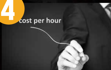
cost per hour

WE KEEP THE COST DOWN FOR YOU. TOUGH IS THE BEST COST/HOUR IN THE MARKET. FROM ACQUISITION COST TO MAINTENANCE. "A PROMISE IS A PROMISE."