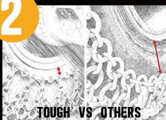
TOUGH VS OTHERS

TALLEST SIDEWALL PROTECTION IN THE MARKET. WE GOT YOU COVERED 100%. "DO IT RIGHT OR DON'T DO IT."