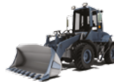
COMPACT WHEEL LOADERS