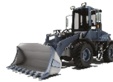
COMPACT WHEEL LOADERS